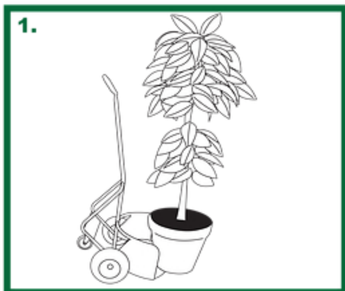
Position base by pot.