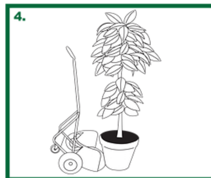
Tilt forward and slide pot off.