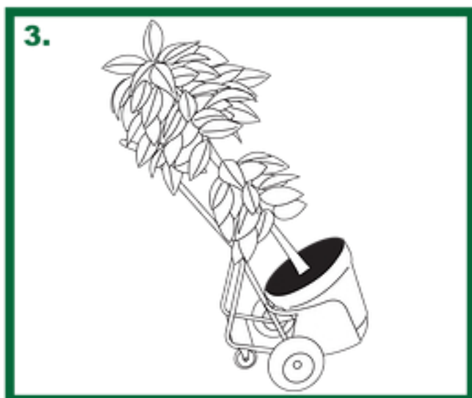
Tilt back on casters and move.